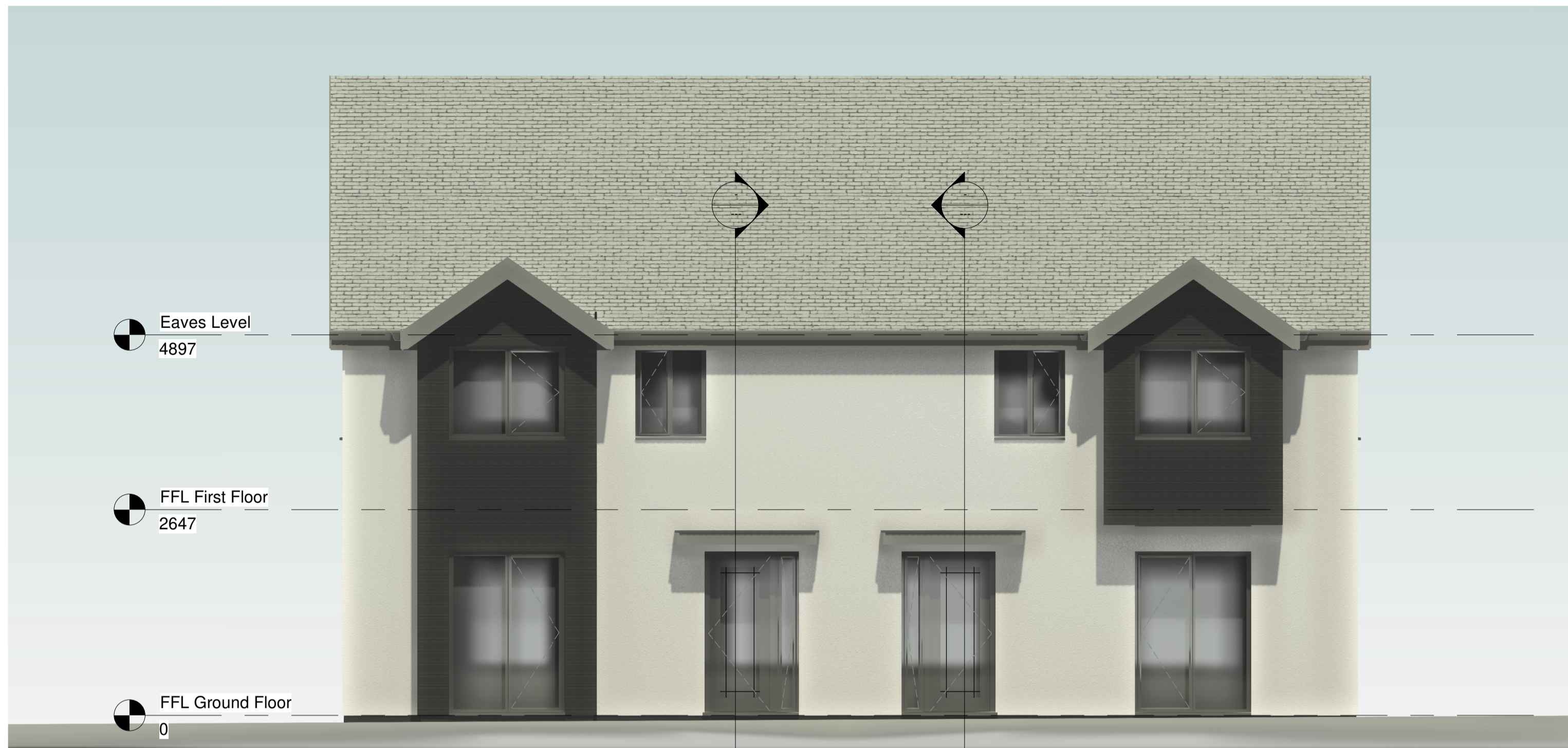
3 Front Elevation 1 : 50