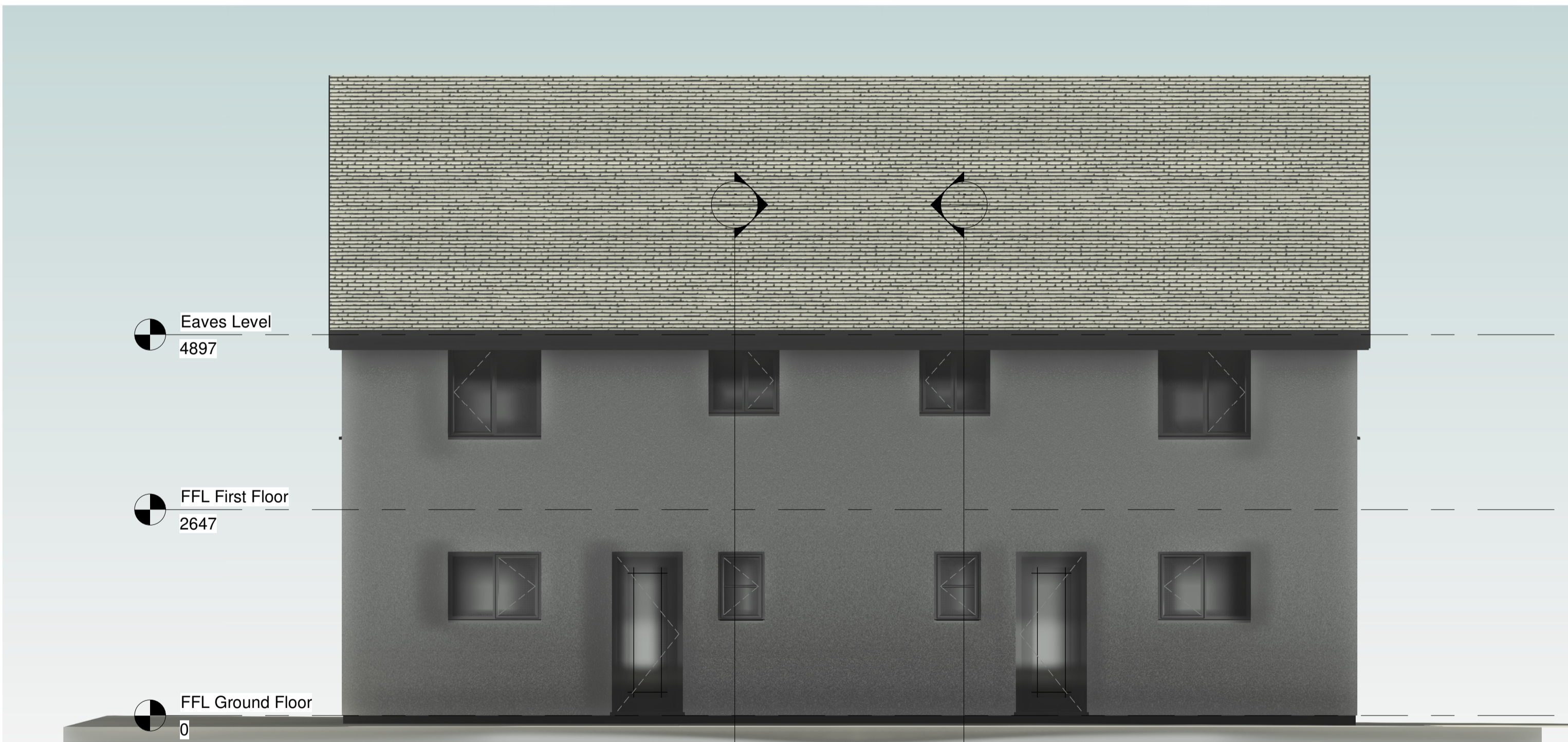
2 Rear Elevation 1 : 50